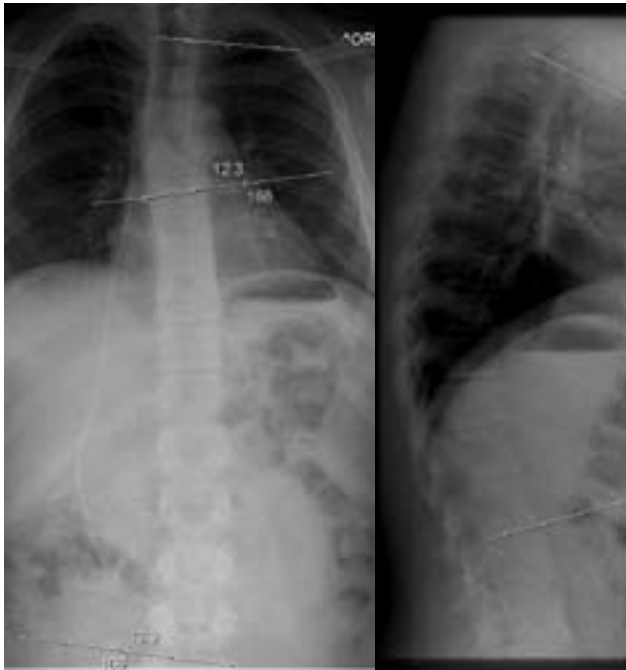
Figure 1 Radiographs of a 13-year-old boy showing a 12° upper right thoracic scoliosis and a 32° kyphosis.

on the right side of female thoracic spines. Scoliosis in pinealectomised chickens is only in the thoracic spine, 8 whereas human idiopathic scoliosis can also occur in the lumbar spine. The thoracolumbar junction was identified as the apex of the scoliotic curve in pinealectomised chickens. 36